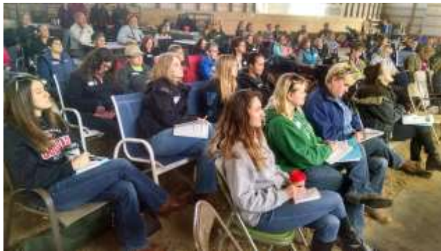
Wisconsin Distance Clinic!