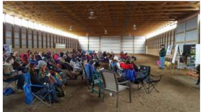
Endurance Clinic – March 19 th – Minnesota (75 participants!)